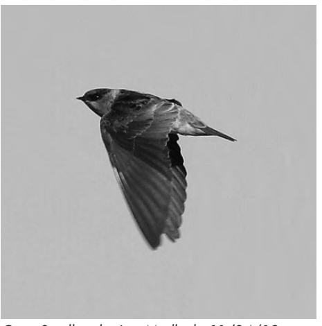
Cave Swallow, 11/24/12, Rye, NH.

Currently, there are five subspecies recognized in North and Central America. The three Caribbean subspecies are P.f. fulva (which is thought to be the